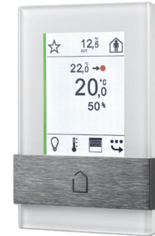
Multiple menus for different applications and scenes