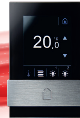
thanos S black