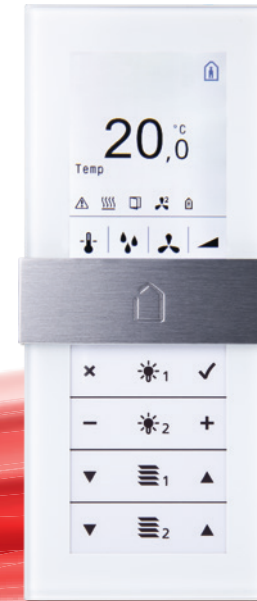
thanos L white