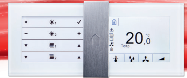
thanos LQ white